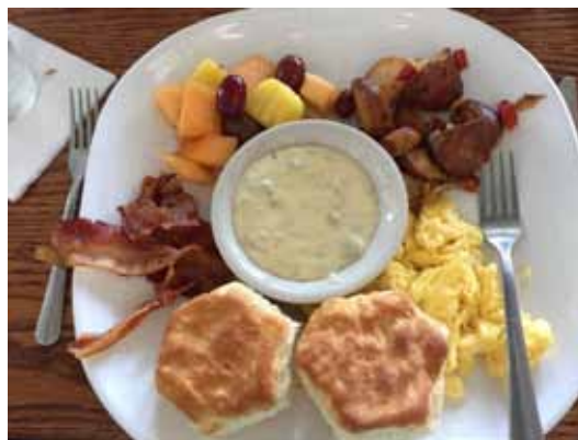
$100 hamburger? Heck no, this is a $100 breakfast!

Visit the EAA 402 website for more fly-out photos and dates of note. Post a comment, or send information to: Gary Kurtz at info@e-Kurtz.com