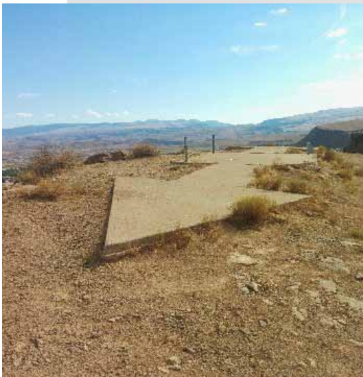
Transcontinental Airmail Route Beacon 37A, from Barney Kemter's Powerpoint Presentation.