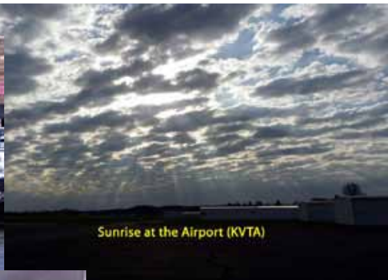
Sunrise at the Airport (KVTA)