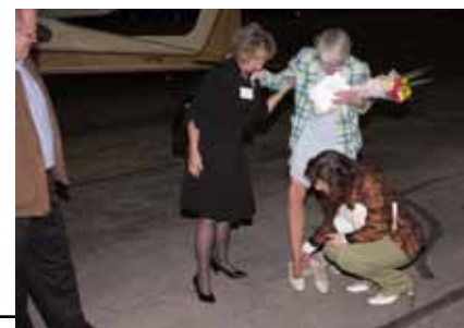
ABOVE RIGHT: The Cessna 180 arrives.