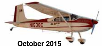
Photo of N1538C