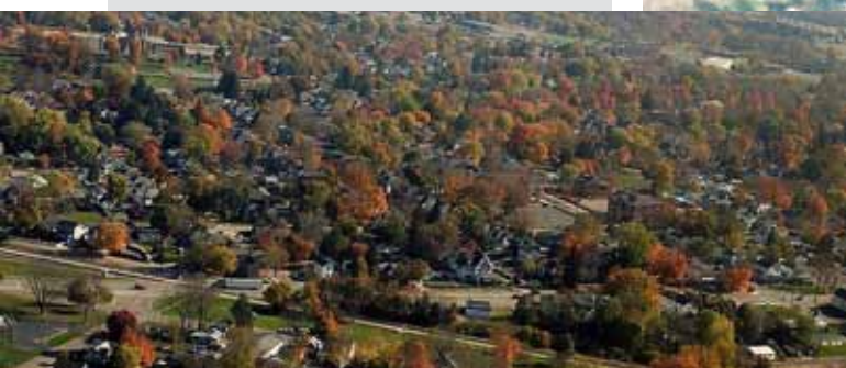
Above: 2016 Urbana Fly-out, Below: 2014 Coshocton Fly-out