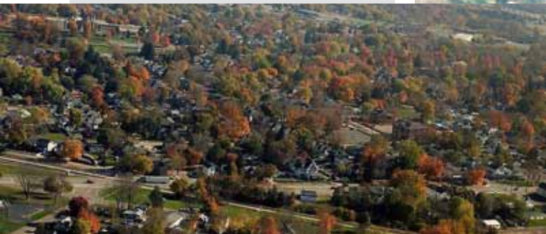
Above: 2016 Urbana Fly-out, Below: 2014 Coshocton Fly-out